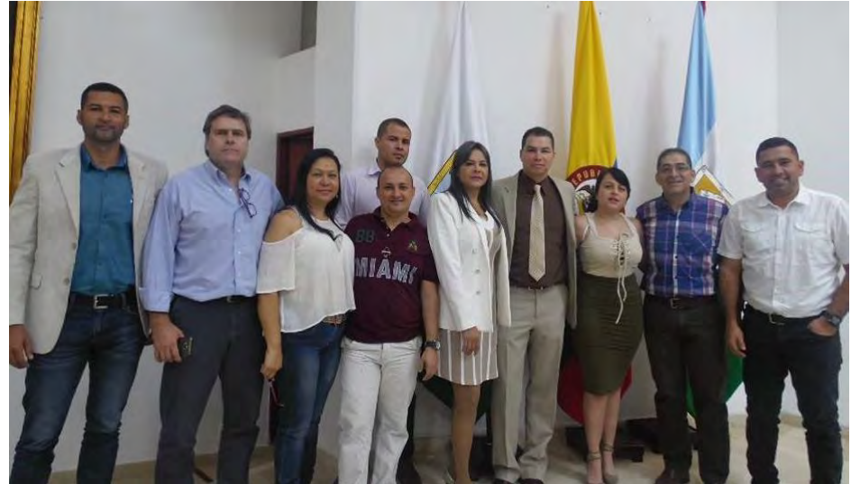
SINTRAESTATALES members part of the Agreement on Public Policies on Decent Work in the Municipality of Bello, Colombia