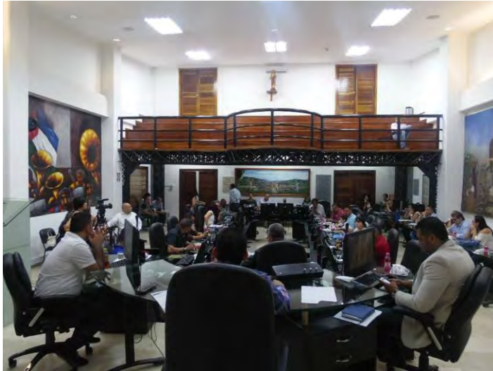
Tripartite commission works in the Municipality of Bello