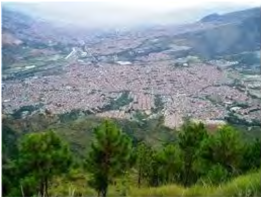
Municipality of Bello, Antioquia, Colombia, 8km from Medellin, more than 700,000 dwellers