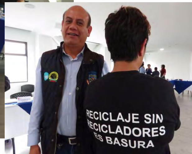
PSI Latin American Waste Workers Meeting, Bogotá Colombia 27-28 July 2017 – 1 st joint workshop with WIEGO Latin America