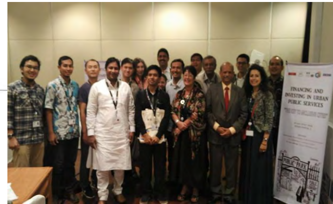
“Financing and investing in urban public services”, PSI delegation at HIII Prep3, Surabaya July 2016