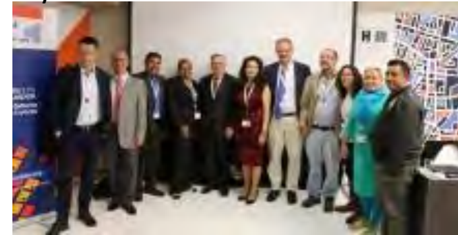
Global Union labour panel at HIII, Quito, October 2016