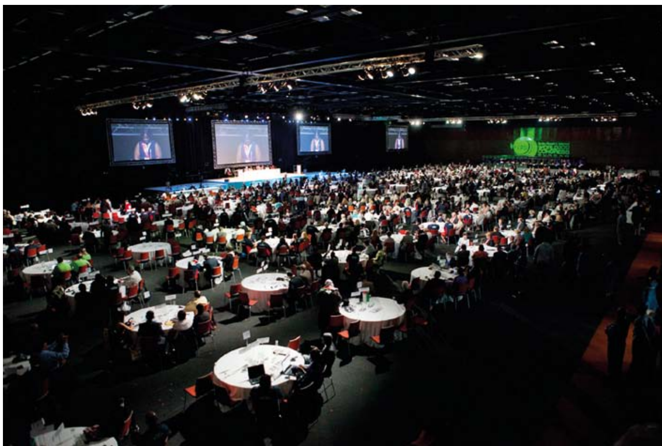
PSI's 29th World Congress, Durban, South Africa, November 2012

45 avenue Voltaire, BP 9 01211 Ferney-Voltaire Cedex, France Tel: +33 450 40 64 64 – Fax: +33 450 40 50 94 psi@world-psi.org www.world-psi.org