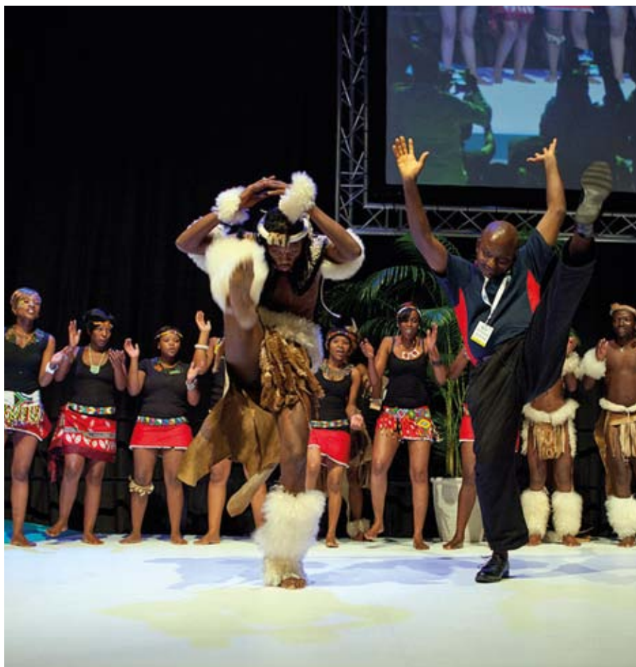
Kwaito Ebkhosini dancers welcome PSI delegates to South Africa

Holding Congress in South Africa gave PSI the occasion to celebrate a country with a rich heritage, and the cultural programme featured vibrant performances including from the Clermont Choir Foundation and the Kwaito Ebkhosini dancers.