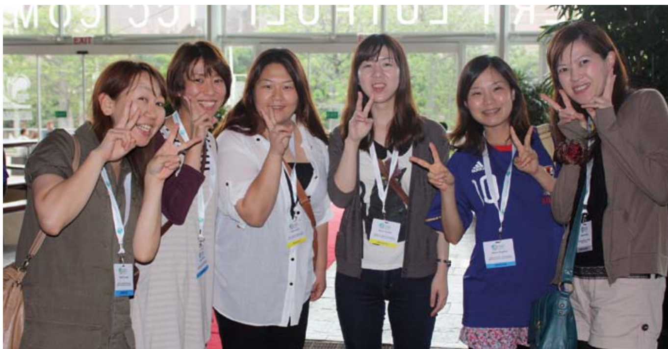
Delegates at PSI's 29th World Congress in Durban, South Africa, November 2012