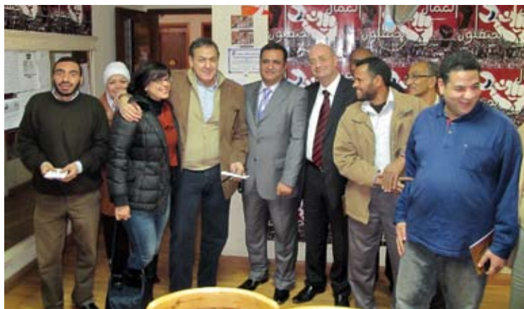
PSI project meetings in Egypt (above) and Botswana (right)

In January 2013, a delegation of PSI affiliates which support union development projects met with PSI's newly-elected General Secretary, Rosa Pavanelli, and discussed strategies and possibilities for future project work. There was a general consensus that trade union project work was a vitally important tool for achieving PSI's objectives and that new efforts were required to ensure the success of projects could be maintained and strengthened. 📌