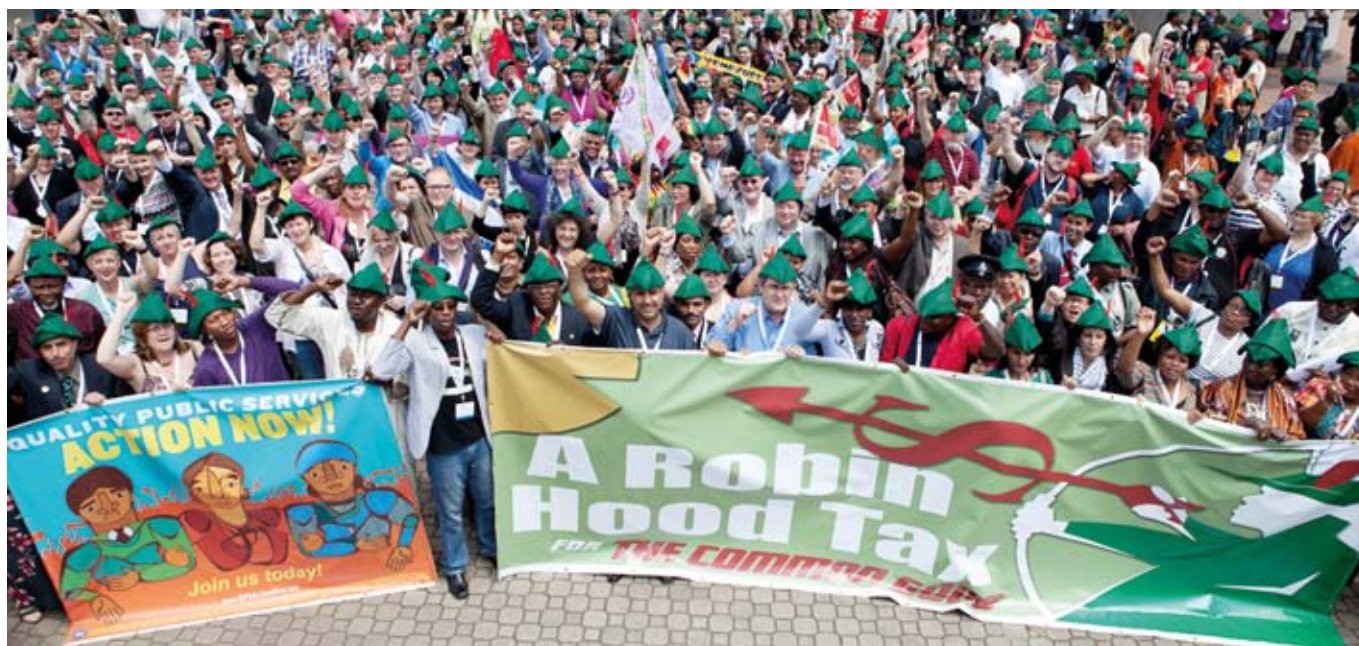
Delegates rally for a Robin Hood Tax at PSI's World Congress