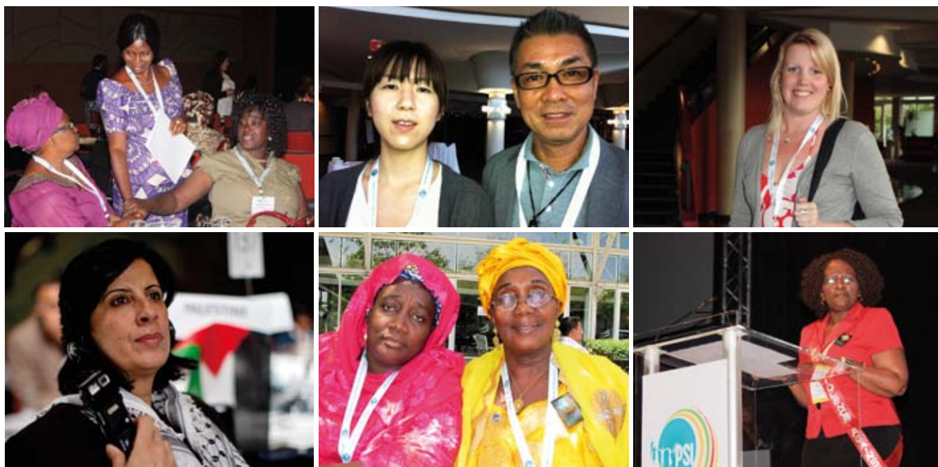
Some of the nearly 700 delegates at PSI’s World Congress

Staff, affiliates and the Congress coordinating teams in Ferney-Voltaire and Johannesburg worked on Congress preparations in the lead up to PSI’s 29 th World Congress, held 27-30 November in Durban, South Africa.