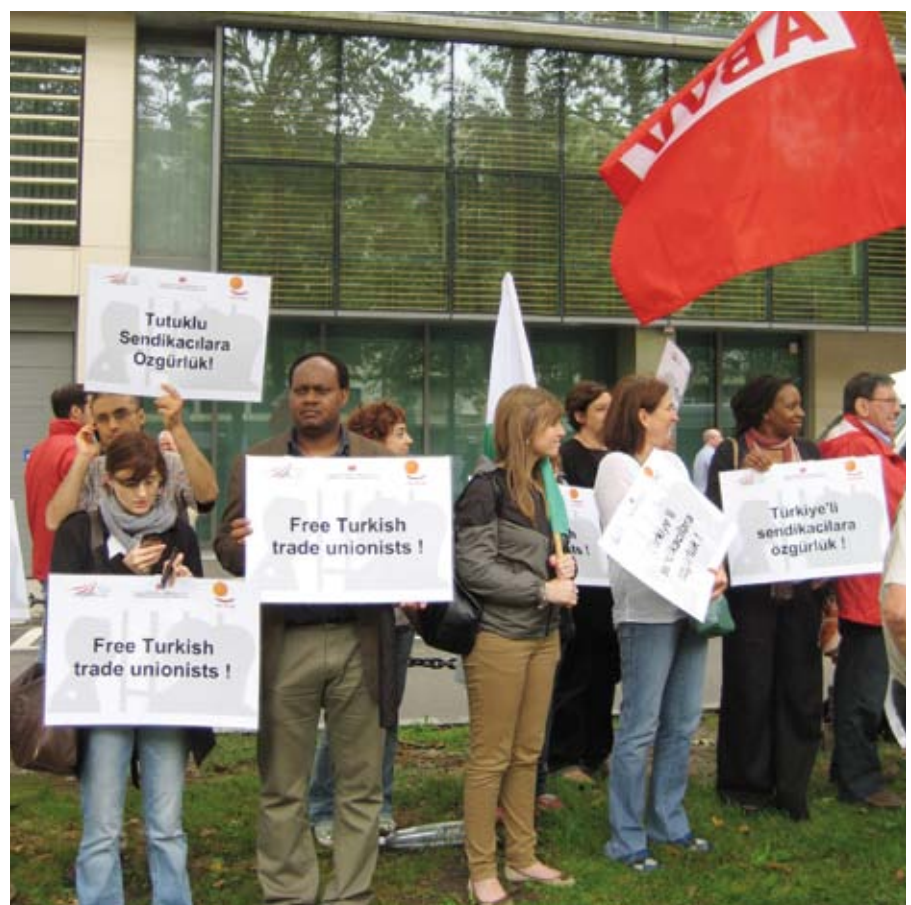
Rally in solidarity with Turkish members, Belgium

For more information on EPSU and more details of its work during 2012, please visit www.epsu.org