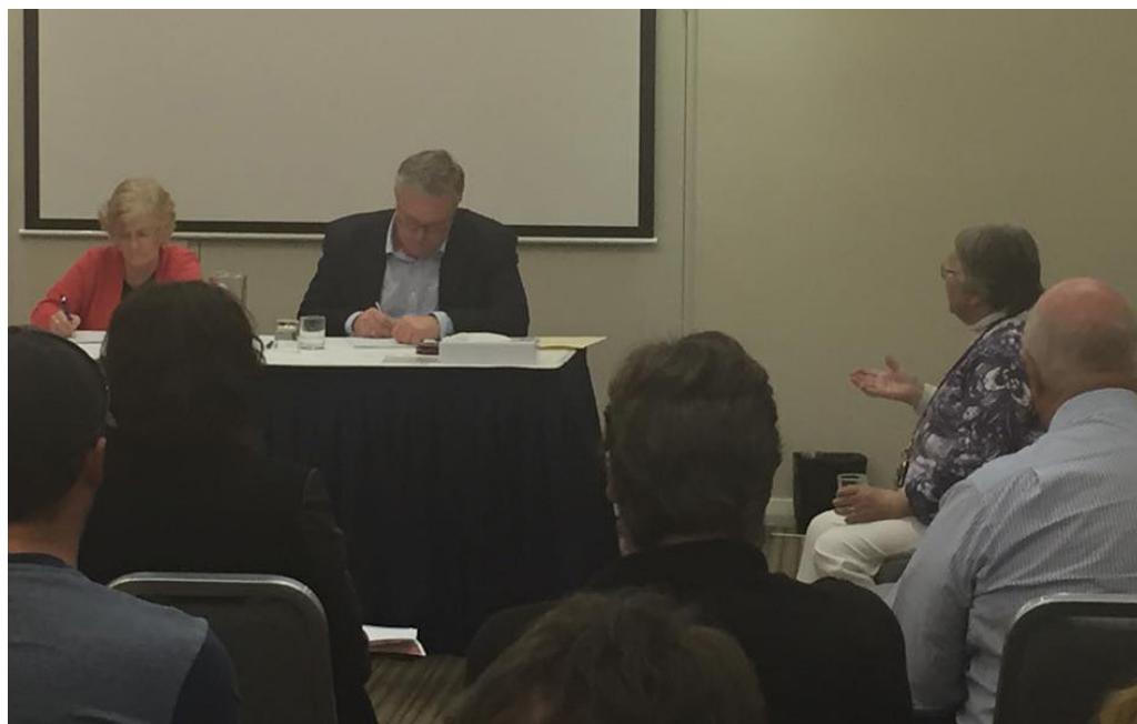
Australia's People's Inquiry: a parent gives evidence to the Inquiry's panel about the impact of privatisation of Aged, Disability and Home Care (ADHC) on social housing and group homes.