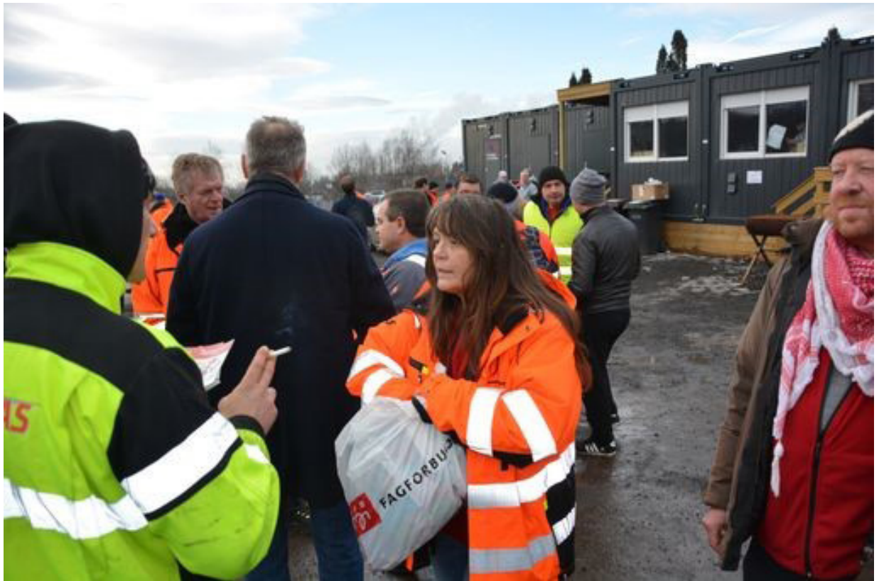
Fagforbundet local shop stewards approach Vereino workers to organize them into the union ahead of the imminent Oslo waste remunicipalisation.